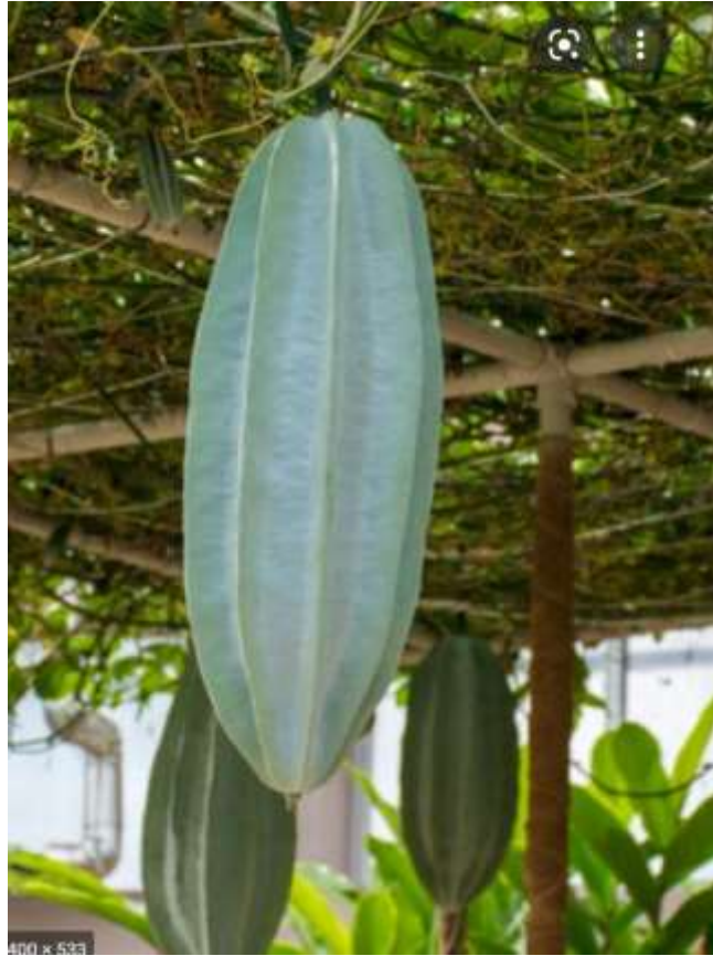
Fig. 2: Pumpkin with support

It is a specie of pumpkin found in some parts of Africa. An important source of food, the leaves are rich in vital nutrients.