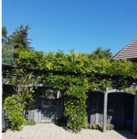
Fig. 1: Vine twining around pergola

Other vines will require objects such as wire and guides to wrap around.